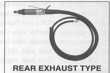
REAR EXHAUST TYPE